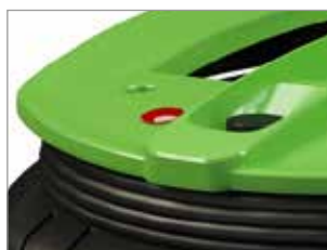
FULL FILTER INDICATOR